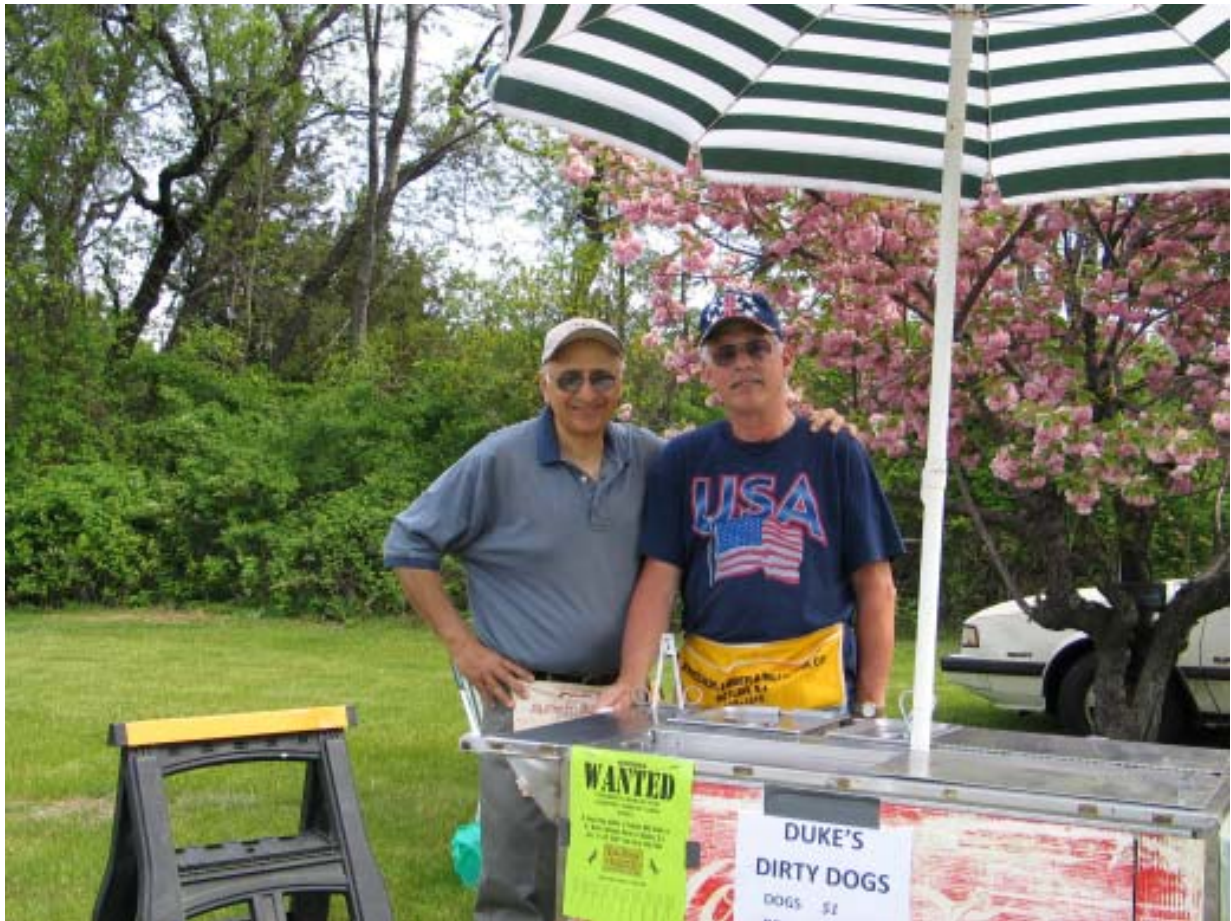
THE DYNAMIC DUO!!