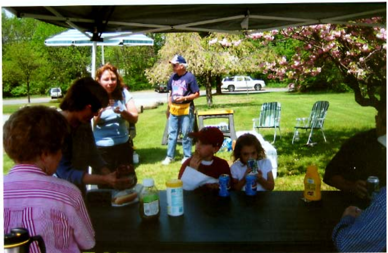
THOSE DOGS HIT THE SPOT!!