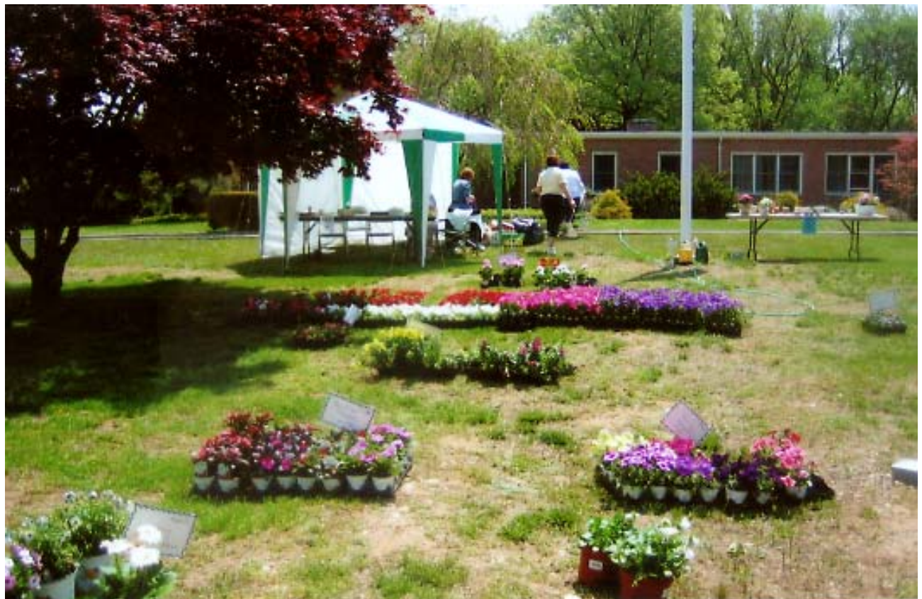
A BLOOMING DAY IN MAY!!